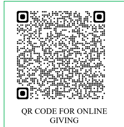
QR CODE FOR ONLINE GIVING

Matthew 25 :35-40 "... For I was hungry and you gave me food, I was thirsty and you gave me something to drink... Truly I tell you, whatever you did for one of the least of the brothers and sisters of mine, you did for me."